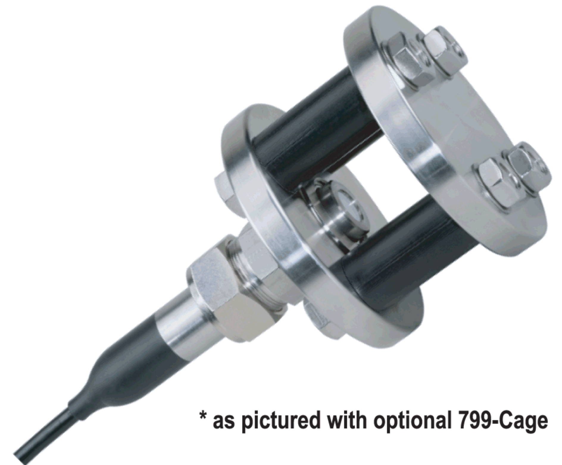
* as pictured with optional 799-Cage

This technology is ideal for pump stations, fuel tanks, ship ballast, storage vessels and all types of water and wastewater applications. The open face ceramic diaphragm avoids clogging or build-up from slurry and wastewater sludge. The optional titanium or PVDF housing with the Tefzel cable are ideal for corrosive environments or saltwater installations.